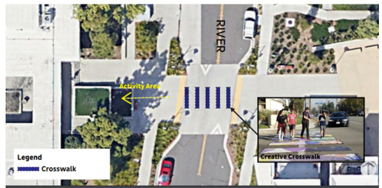
Site Plan for the artistic crosswalks at the event